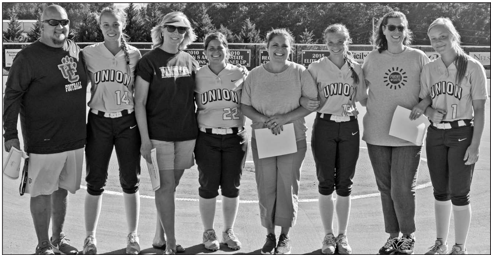
Teacher Appreciation Day: Union County senior softball players recognized their favorite teachers before last Thursday's 15-0 victory over Putnam County